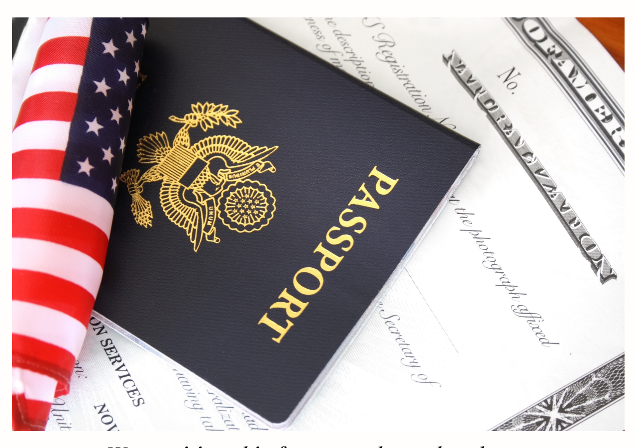
We get citizenship for you and your loved ones